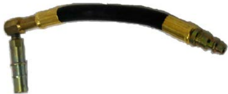
Part # FQD12 NEW Ford Quick Disconnect 1/2" Ford F-150, For 6L Fords Mustangs 07 and Up Excursion and Expeditions