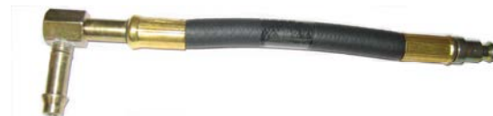
NEW Yukon GM 1/2 Male Push to Connect