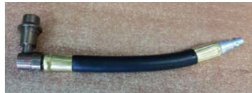
Part# GMA58-1 Male 5/8" Push to Connect GMC Duramax 2000-2004 Models