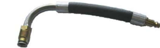
Part # DFM12 NEW Deep Flare Male 1/2 2003 + Ford