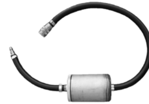
Part # ATS-FI ATS Fluid Injector for Cleaner or Conditioner Use on Sealed Transmissions