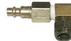
Part # 4208 GM 3/8 Female Quick Connect Use with GMA 3/8