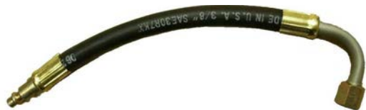
Part # CFM Chrysler Female Metric Dodge Durango