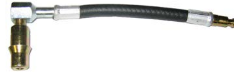
Part # GMA58 Male 5/8 Push to Connect GMC Duramax Hose