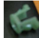
Part # 3102 Plastic Clips