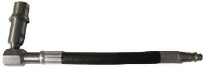
Part# GMA3/4 NEW Male 3/4 Push to Connect GMC Duramax Hose