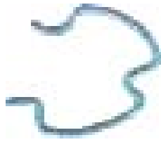
Part # 4247 1/2 retainer clip