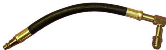
Part # CMM Chrysler male Metric Dodge Durango