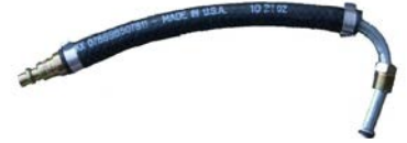
Part # FM3178 NEW Ford Male for an F150