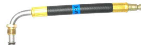
Part# GMM16 NEW Jeep