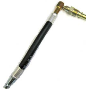
Part# JAG-M Jaguar/Land Rover adapter Male