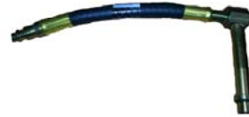
Part # BMWM12 Volkswagen/Audi/BMW