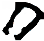
Part # 3222 Ford Fuel Line Retainer Clip 3/8 Replacement for UFQD38