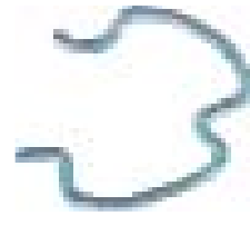
Part # 4248 5/8 truck retainer clip