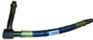
Part # BMW10 Volkswagen/Audi/BMW