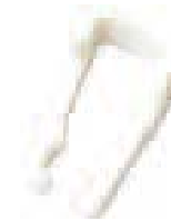
Part # 3318 1/2 Vent Connector