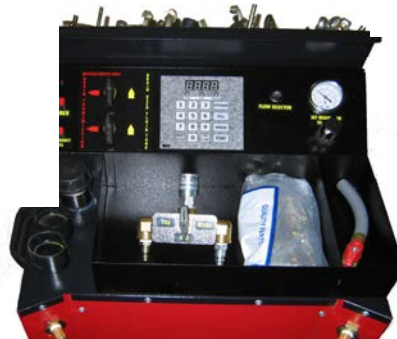
Part# F-0220 Organization Fitting Box that hangs off the back of ATS 320/330