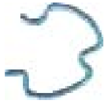
Part # 4246 3/8 retainer clip