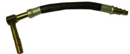
Part # FQD516 NEW CA Origin