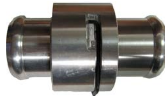
Part# 7975-C as set Quick disconnect for BMW