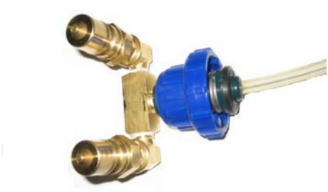
Part# RC-043 Radiator Cap Adapters