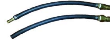
Part# 7106 3/8" Hose Adapter