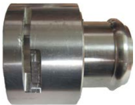
Part# 7975-A Quick disconnect for BMW