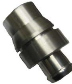
Part# 7977-B Quick disconnect for Ford Diesel