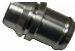
Part# 7976-B Quick disconnect for Audi/Volks