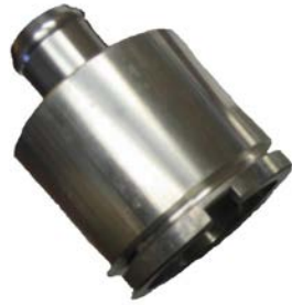
Part# 7977-A Quick disconnect for Ford Diesel