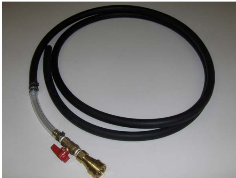
Part# 7016 1/4" Black Hose