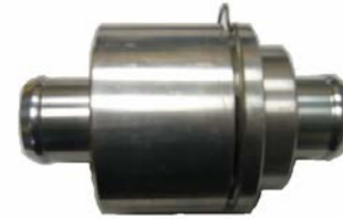
Part 7977-C as set Quick disconnect for Ford Diesel