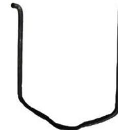
Part# 7975-D Hanger for BMW

**All Quick Disconnects come with Part# 7010 ¼ straight hose