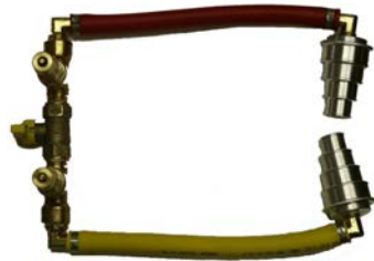
Part # 7013 (1 per RCS 540) 5 Step Loop Hose