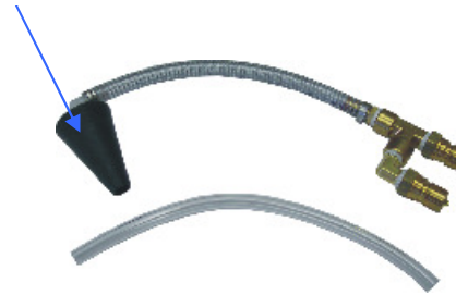
Part # 7015 12" long 3/8" Clear Hoses and One Rubber Cone Adapter