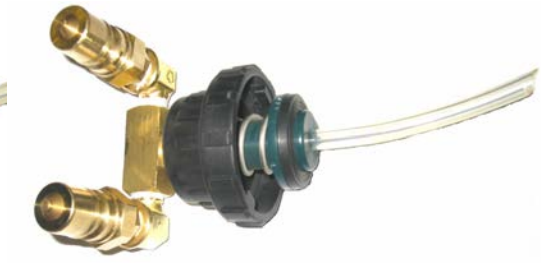
Part# RC-050 Radiator Cap Adapters