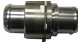
Part 7976-C as set Quick disconnect for Audi/Volks