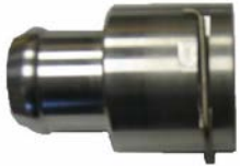
Part# 7976-A Quick disconnect for Audi/Volks