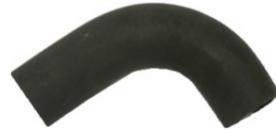
Part # 7009-90 1 1/2 90° Hose