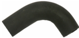
Part # 7008-90 1 3/4 90° Hose