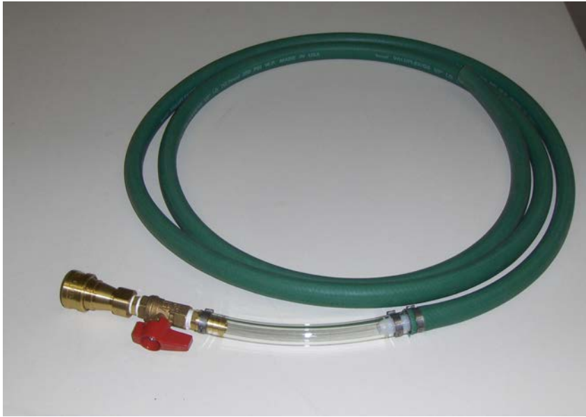
Part# 7016-2 1/2" Green Hose