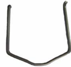
Part# 7977-D Hanger for Ford Diesel