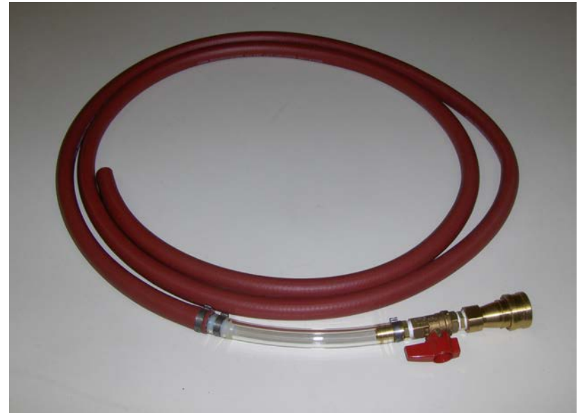
Part# 7016-1 1/2" Red Hose