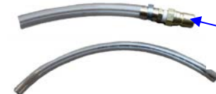
Part # 7012 1/2" and 3/8" Clear Hose Adapter