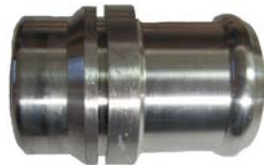
Part# 7975-B Quick disconnect for BMW