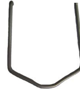
Part# 7976-D Hanger for Audi/Volks