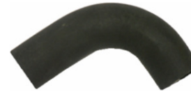
Part # 7010-90 1 1/4 90° Hose